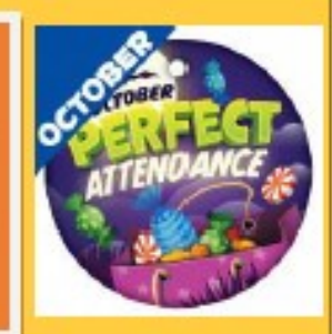
October Perfect Attendance tags will be handed out this week.

To reach the guidance office, please call 386-322-6230 extension 33497 (Howard) or 33326 (Elliott) or email tmhoward@volusia.k12.fl.us.